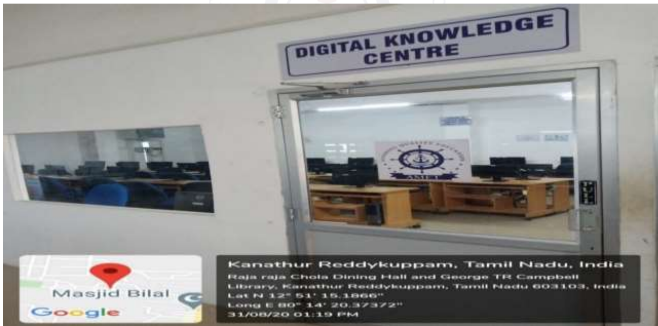
Teaching Learning Facility – Common Computer Laboratory Sample Photos

Altitude -60.6 meters Thursday, 27-08-2020