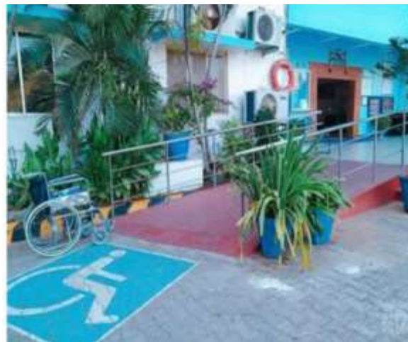
Parking space for physically challenged are reserved near the ramps