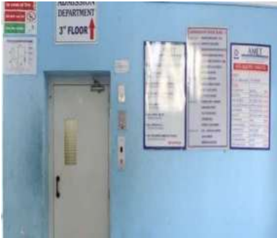
Lift at B Block

AMET UNIVERSITY (Deemed to be University Under Section 3 of JUGC Act 1983)