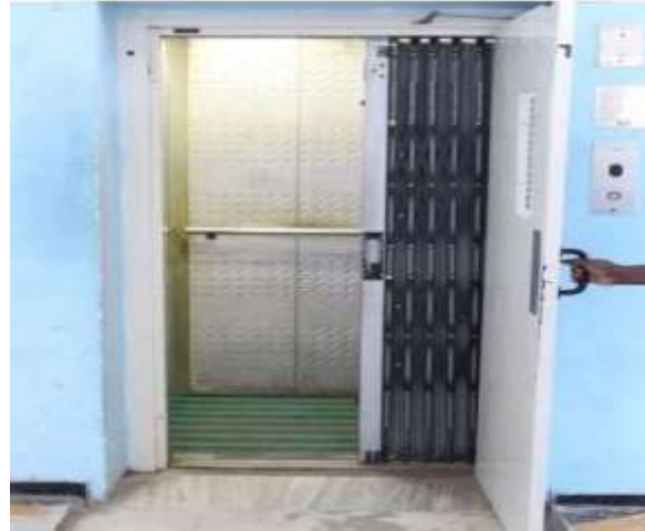
Lift at B Block