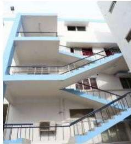
Mahatma Gandhi Block with steel ramps to make easier access.