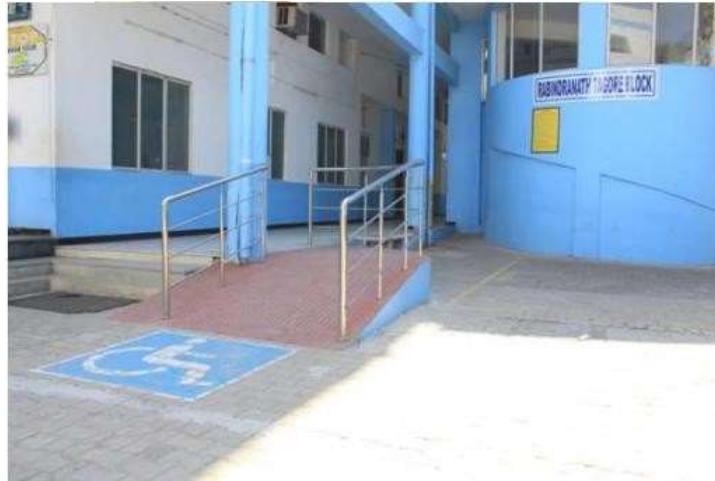
Parking area for disabled with ramp accesses in Rabindranath Tagore Block, AMET

AMET UNIVERSITY (Deemed to be University Under Section 3 of UGC Act 1956)