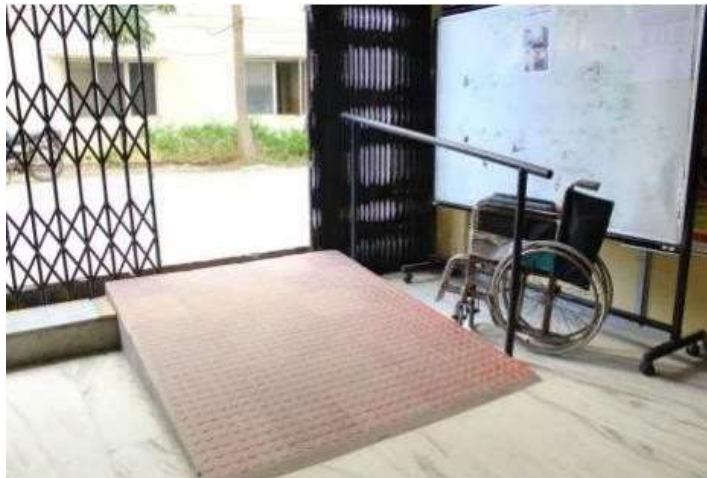
Provisions for ramps in all possible entry to the Hostel