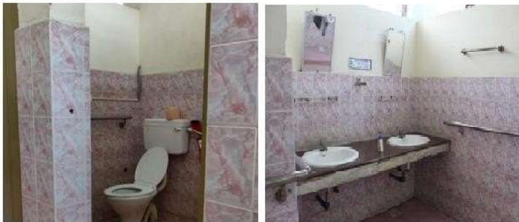
Toilets for physically challenged persons