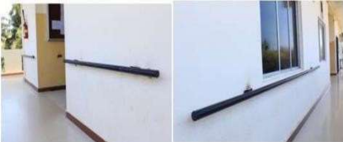
Hand rails in corridors – “F” Block, AMET