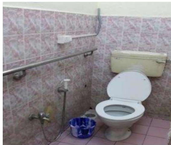
Emergency alarm in Toilets for Physically Challenged