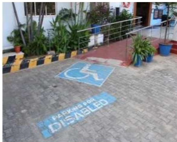
Ramps in the Academic/Administrative