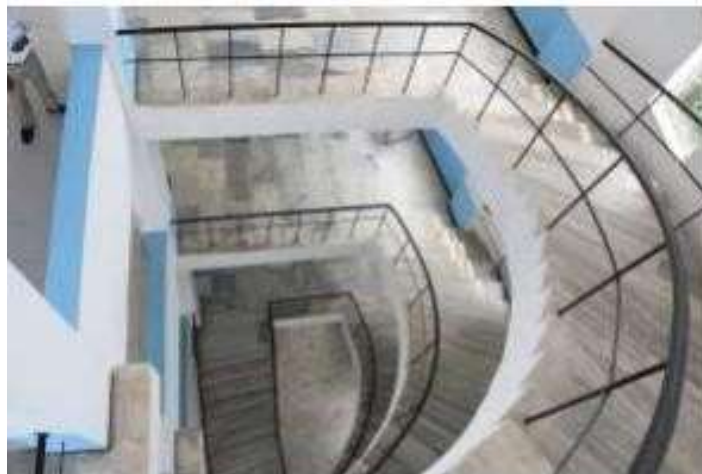
Rabindranath Tagore Block with steel ramps to make easier access.