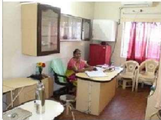
Round the clock Health Centre and Ambulance