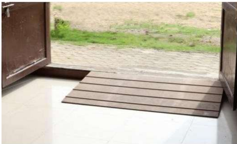
Portable wooden ramp to facilitate easy access in needed locations