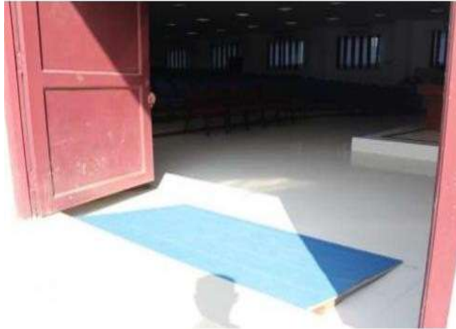
Provisions for ramps in all possible entry to the auditorium

AMET UNIVERSITY (Deemed to be University Under Section 3 of UGC Act 1956)