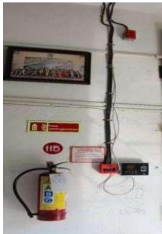
Hooter Alarms have been fixed in the following points in addition to the formal emergency