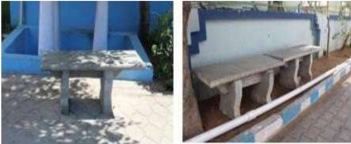
Seating arrangements throughout the campus (every 200 m)