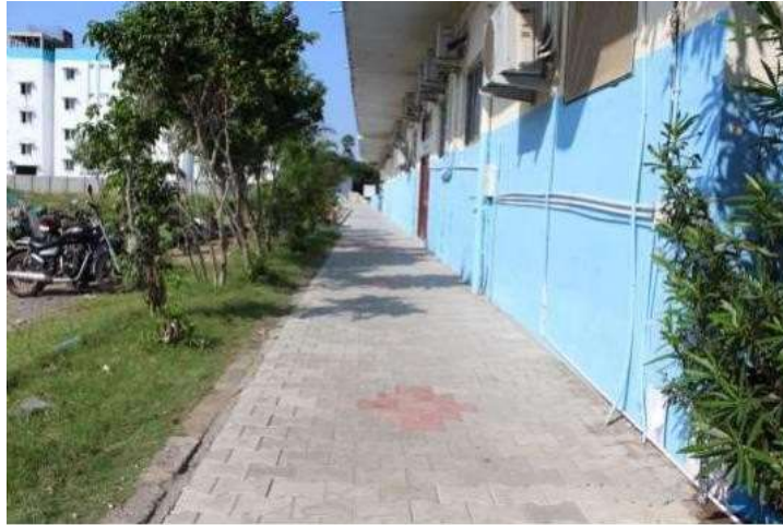
Access to the auditorium/seminar halls for physically challenged/Wheel chairs

AMET UNIVERSITY (Deemed to be University Under Section 3 of UGC Act 1956)