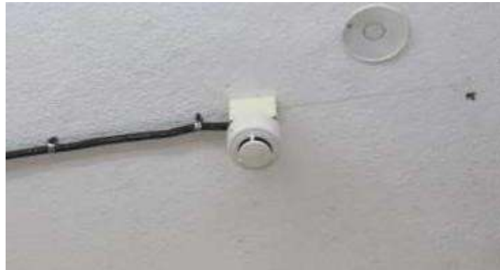
Smoke sensor present in the campus

AMET UNIVERSITY (Deemed to be University Under Section 3 of UGC Act 1956)