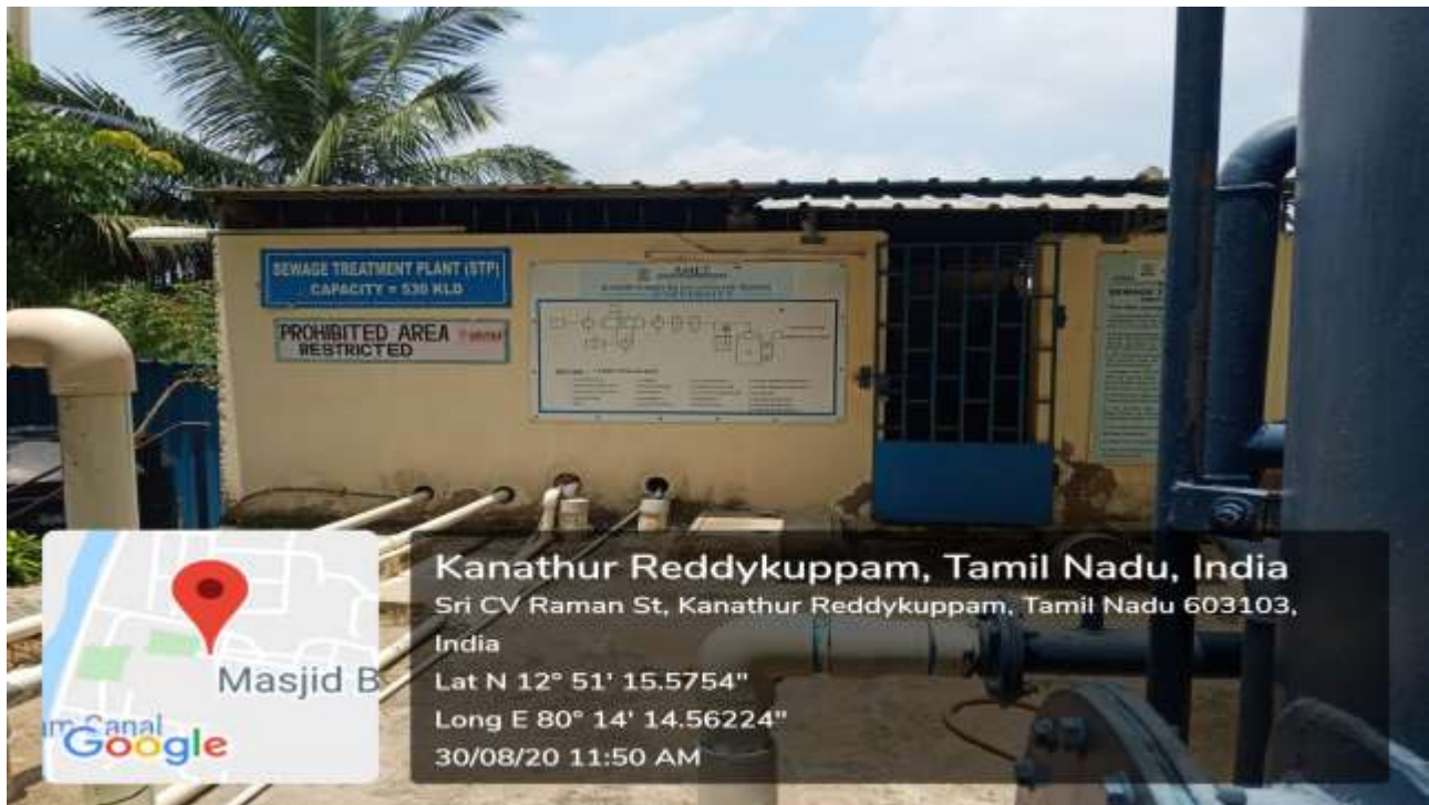
12. Reverse Osmosis (RO) Plant