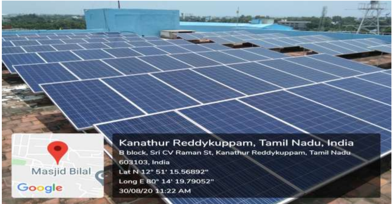
11. Sewage Treatment Plant (STP)