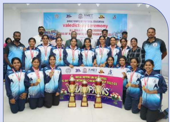
AIU - All India Inter Universities Tug of War - Women Tournament 2022-23