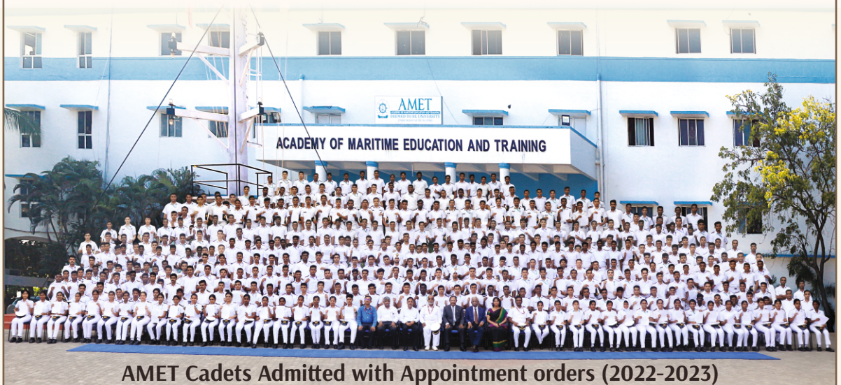
AMET Cadets Admitted with Appointment orders (2022-2023)