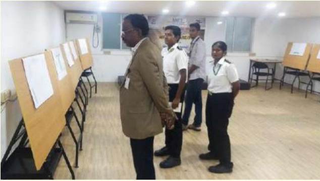
AMET Students Council organized an Art Exhibition about Water Scarcity on 27.03.2019