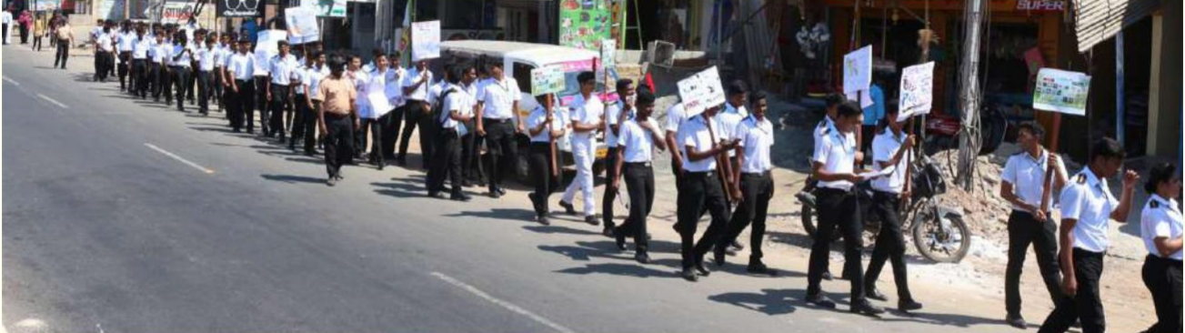
Students of AMET participated in Plastic free rally campaign on 14.02.2019 at East Coast Road, Kanathur, Chennai