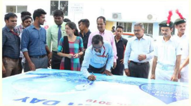
Rotaract Club organized a World Water Day 2019 signature campaign at campus on 22.03.2019

LEO Club of AMET organized a Mega Blood Donation Camp in collaboration with Kilpauk Medical College & Hospital, Chennai at Shri Janakiraman auditorium on 18.03.2019.