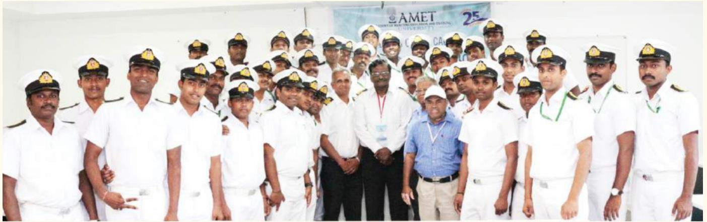
10th Batch of ETO cadets passing out ceremony held at DNV Hall II on 31.03.2017