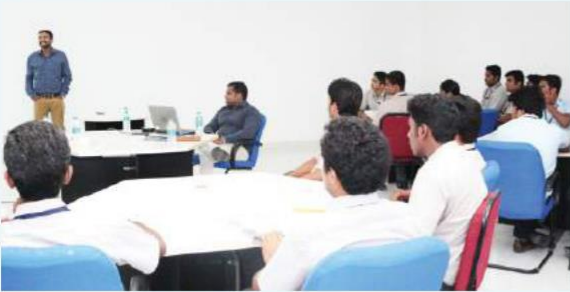
M/s. Deugro Logistics visited to recruit our students from AMET Business School on 30.03.2017