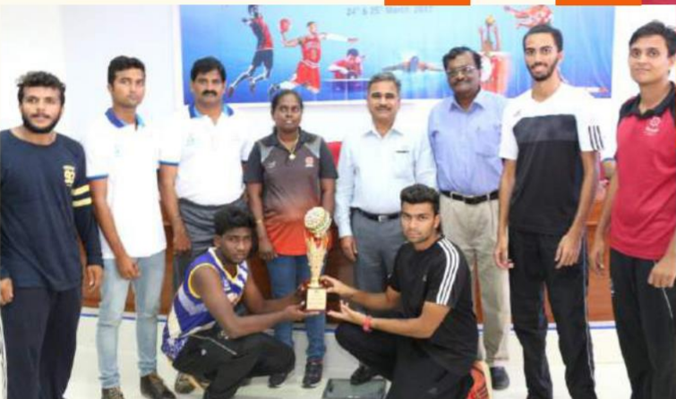
AMET Secured Overall Champion Prize distribution Ceremony was held on 25th March 2017. During this event the prize winners and the participants were honored with Trophies, Certificates, Medals and