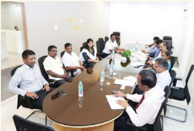
Skill Development Centre for Fishermen Community in Kanathur Village project of AMET, New era Association of Education Self - Employed Youth (NAESEY) and AMET Alumni Association held at Chancellor's Conference Hall on 22.05.2017