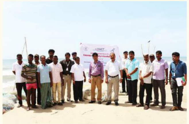
Skill Development Centre for Fishermen Community in Kanathur Village project of AMET, NAESEY and AMET Alumni Association at Kanathur Reddykuppam on 06.06.2017