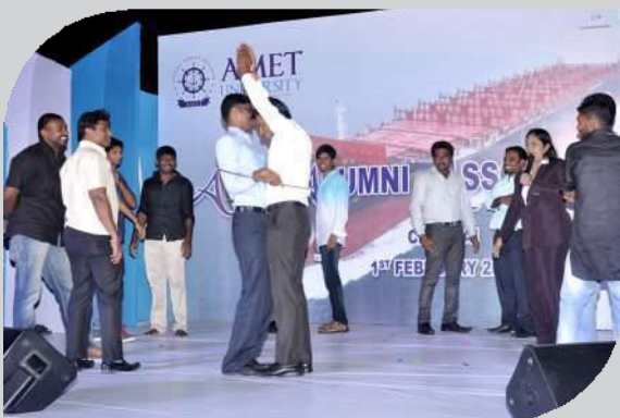
Fun games for alumni members