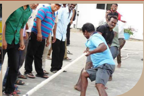
Staff recreation events organized by the Department of Physical Education.