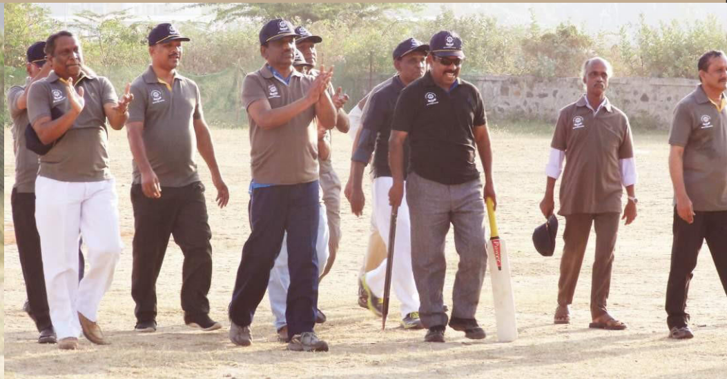
Department of Physical Education organized 'AMET UNISPO 2013-14'. Veteran's Cricket Match played at University cricket ground. The President's Eleven Team won the match against the Vice-Chancellor's Eleven Team.