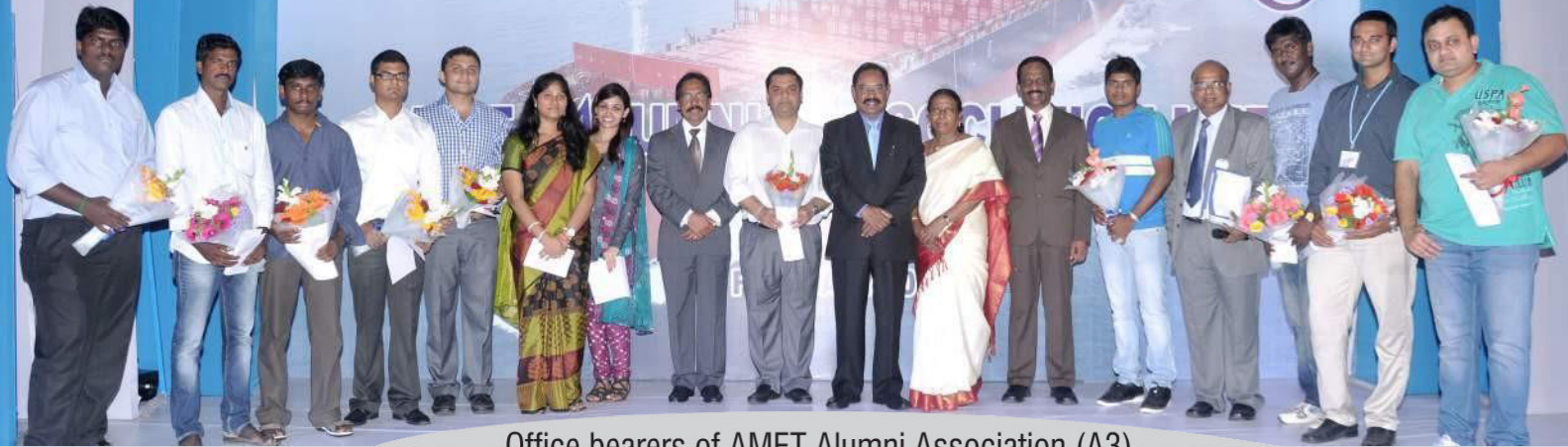
Office bearers of AMET Alumni Association (A3)